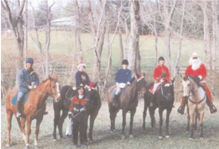
Santa and his helpers go caroling on horseback.